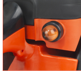
Fuel pump (Primer)