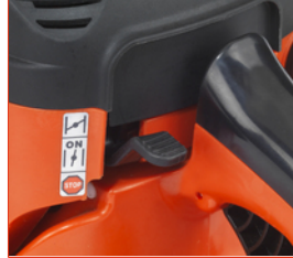
Touch&Stop one lever operating