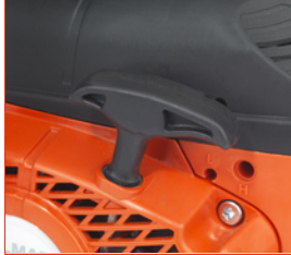
Easy Start: Spring assisted starter combined with optimized engine management